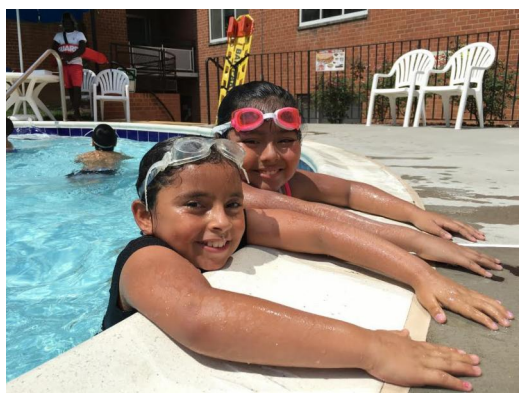
It wouldn't be summer without a weekly trip to the pool...