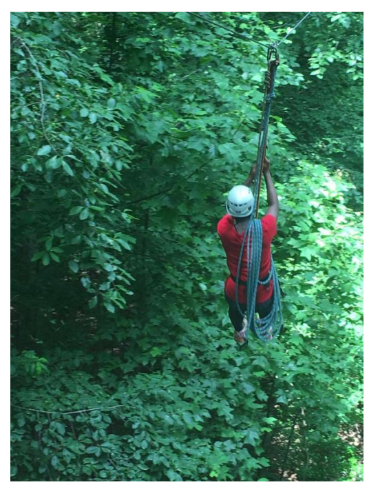
or those amazing Friday field trips...

Twenty of our lucky middle school kids spent a week at the <u>Animal Welfare League of Alexandria</u> learning all about how to take care of animals. Who knows how many came home with a new pet?